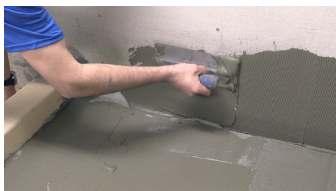
Apply bonding agent