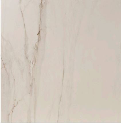
48x48 NAT RECT AM-200339E