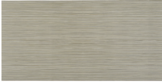
12x24 NAT BOLD | AM-79860ET