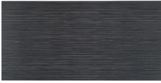
12x24 NAT BOLD | AM-79871ET