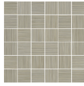
12x12 NAT TEL AM-79529ET