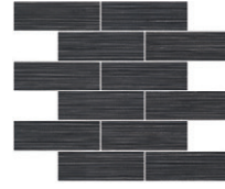
12x14 NAT TEL AM-79542ET