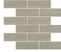
12x14 NAT TEL AM-79541ET