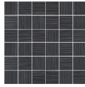
12x12 NAT TEL AM-79530ET