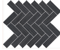
12x14 NAT TEL AM-79534ET