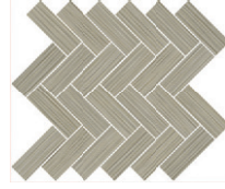
12x14 NAT TEL AM-79533ET