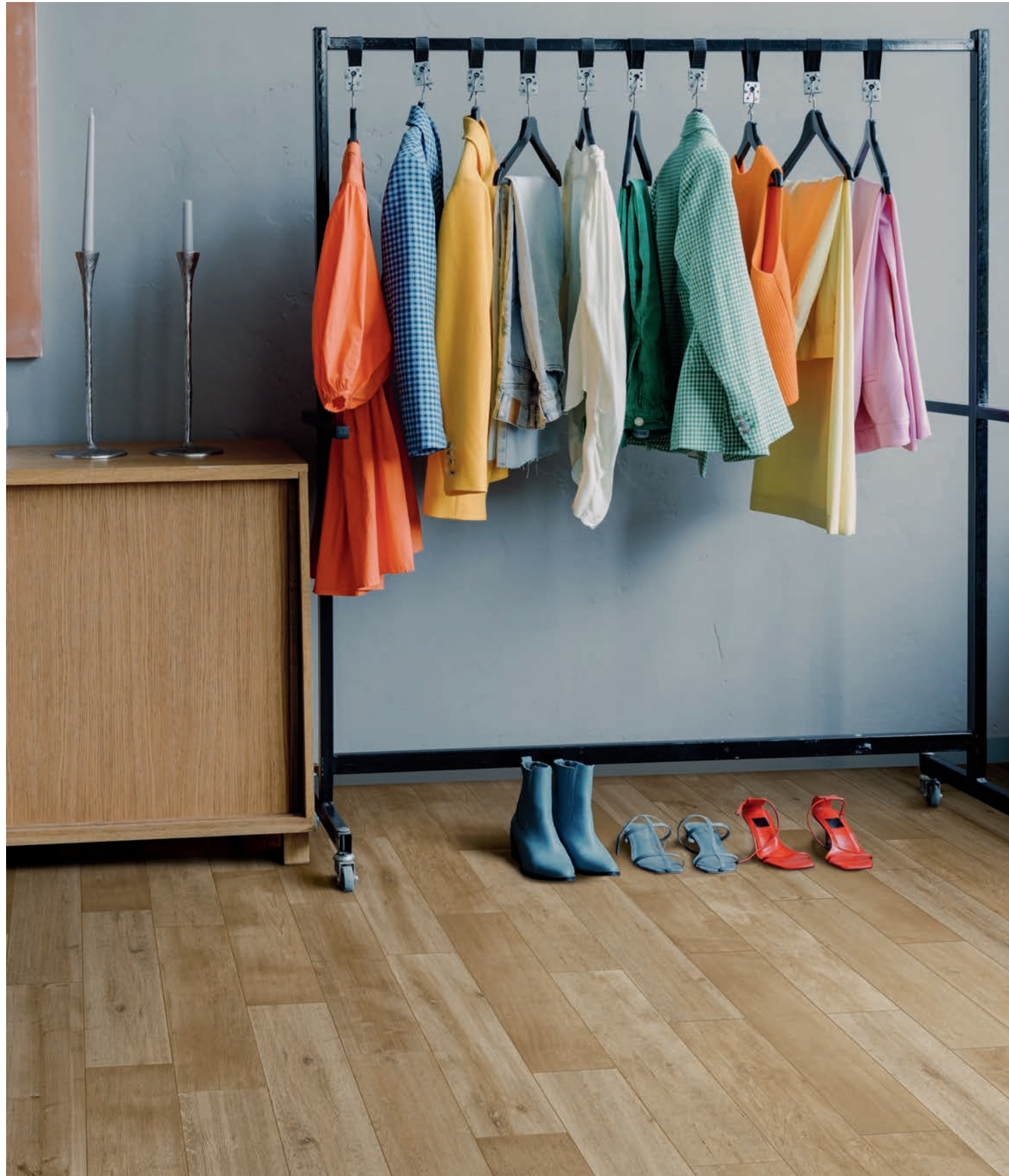
Floor: Lumber LU03 Honey 6"x24"