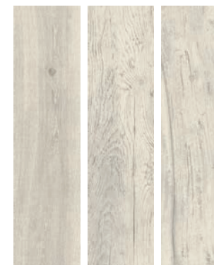
17LU10 Lumber LU10 Bianco 6"x24" . 15x60 cm