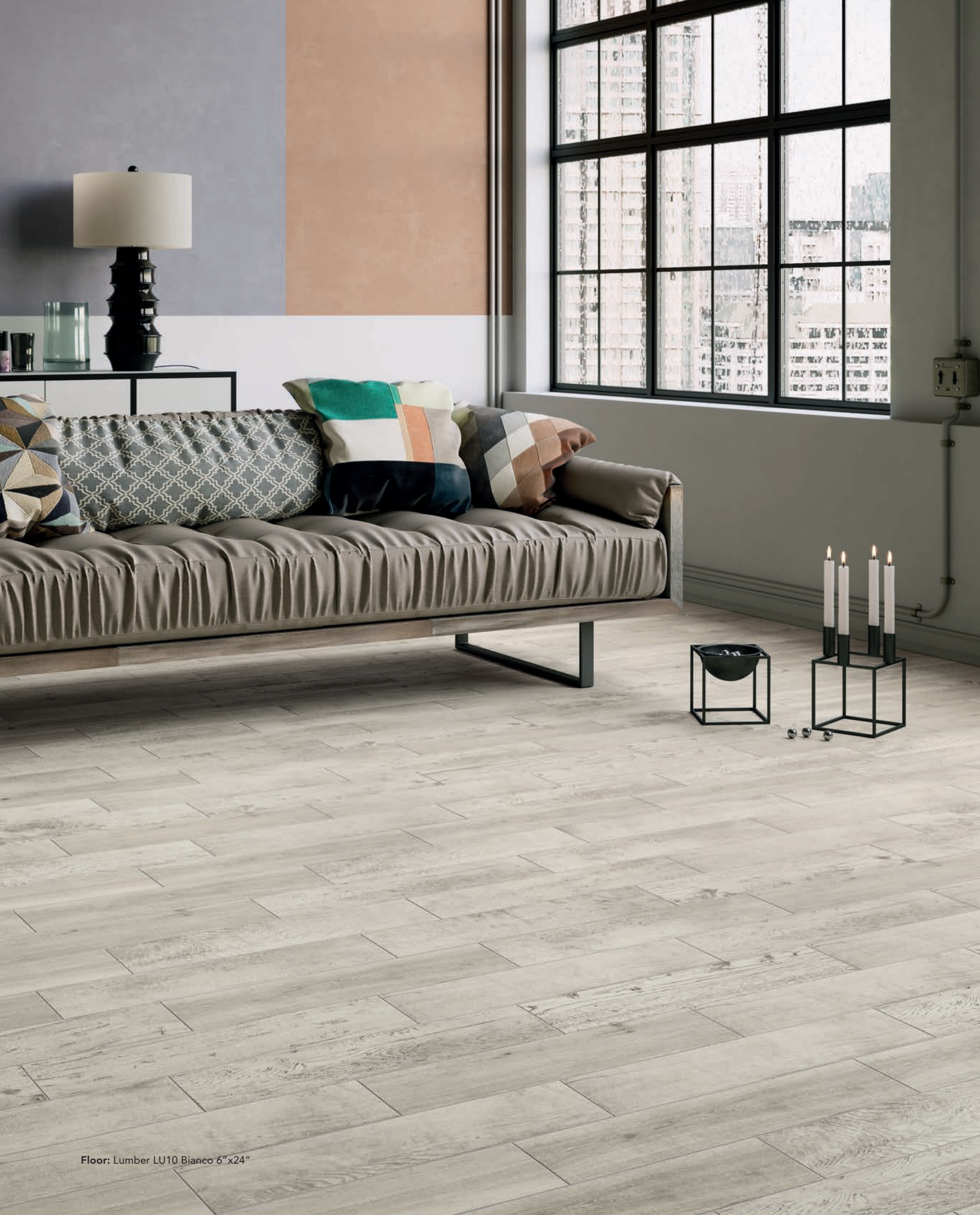
Floor: Lumber LU10 Bianco 6"x24"