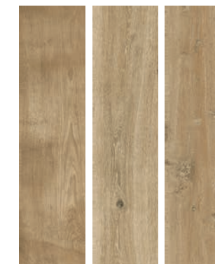
17LU03 Lumber LU03 Honey 6"x24" . 15x60 cm