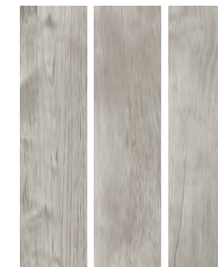
17LU05 Lumber LU05 Gray 6"x24" . 15x60 cm