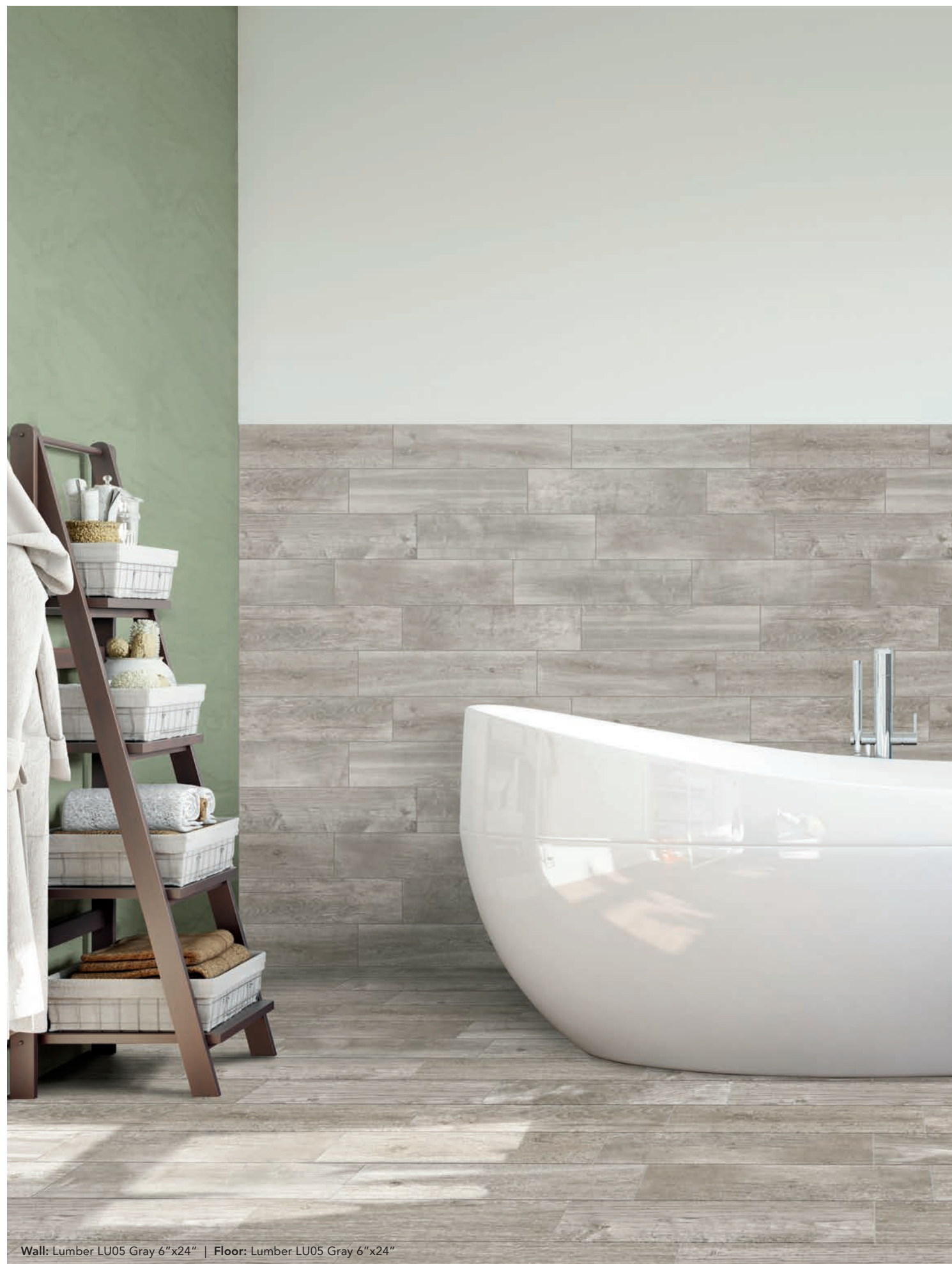
Wall: Lumber LU05 Gray 6"x24" | Floor: Lumber LU05 Gray 6"x24"