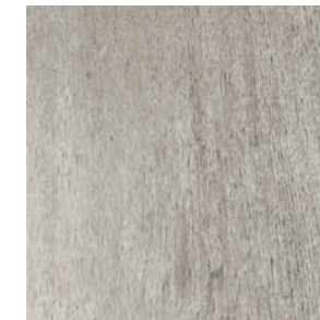
Lumber LU05 Gray