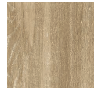
Lumber LU03 Honey