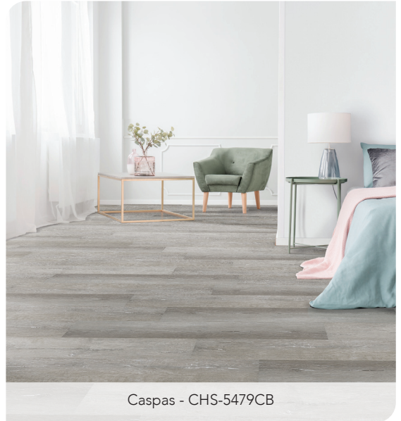
Caspas - CHS-5479CB