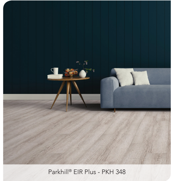
Parkhill® EIR Plus - PKH 348