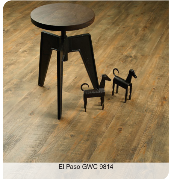
El Paso GWC 9814