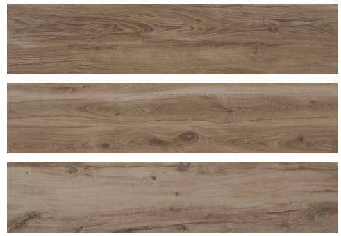
19.5x91.2 cm | 8"x36" MA ( MATTE )