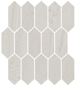
Moonstone Off-White Picket Mosaic

12-1/4" x 11-1/8" sheet (cuts 2"x5") AC (SATIN) - DCOF WET ≥0.42 CERAMIC FLOOR/WALL TILE