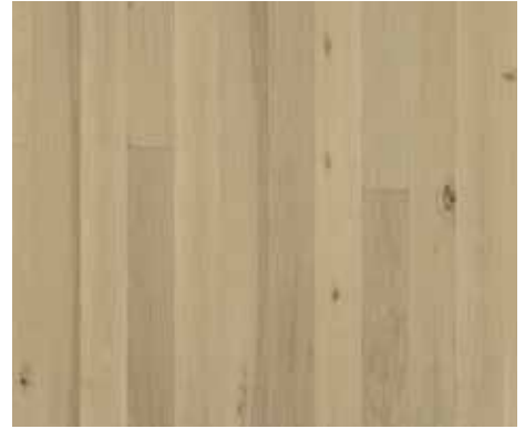
KETCH HICKORY RE6KETH