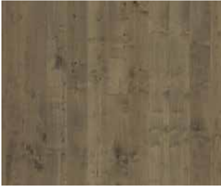
COMPASS MAPLE RE6COMM