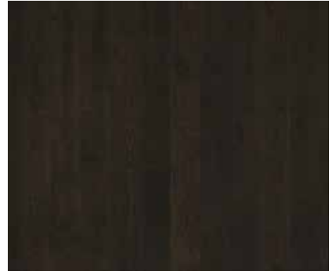
HARBOR OAK RE6HARO