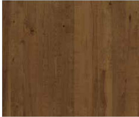
PORT HICKORY RE6PORH