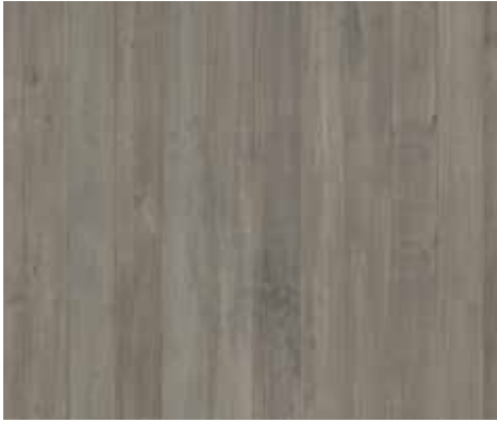
BALLAST MAPLE RE6BALM