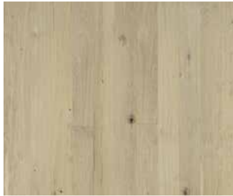
HALYARD OAK RE6HALO