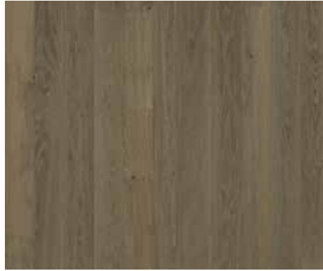
ANCHOR OAK RE6ANCO