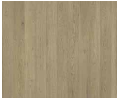
STARBOARD HICKORY RE6STAH