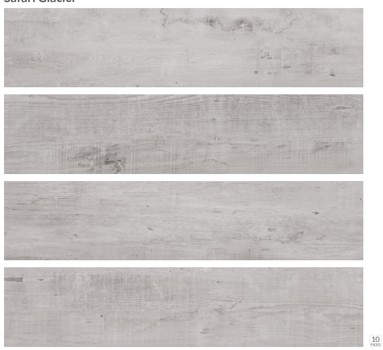
19.5x91.2 cm | 8"x36" MA ( Matte ) - DCOFWET ≥ 0.42 - FLC . FWI . WRC . WFA