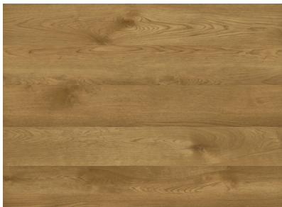
CVA 357CB - Captain