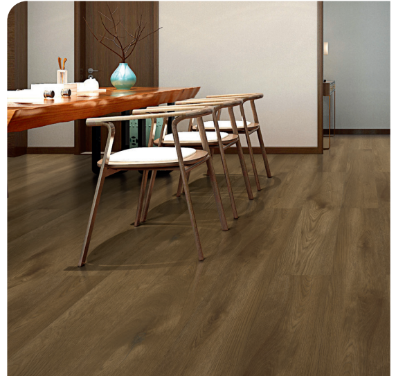
Beacon - CVA-359CB