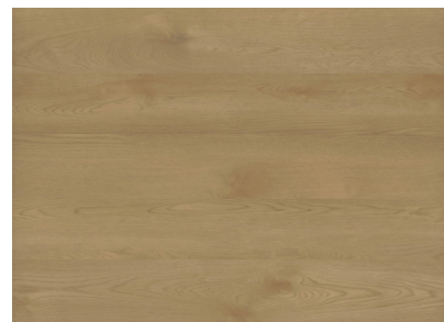
CVA 361CB - Sail