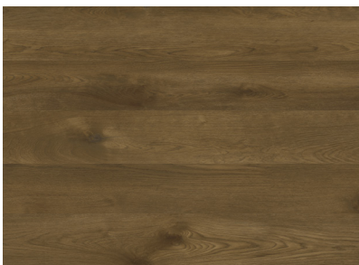
CVA 359CB - Beacon