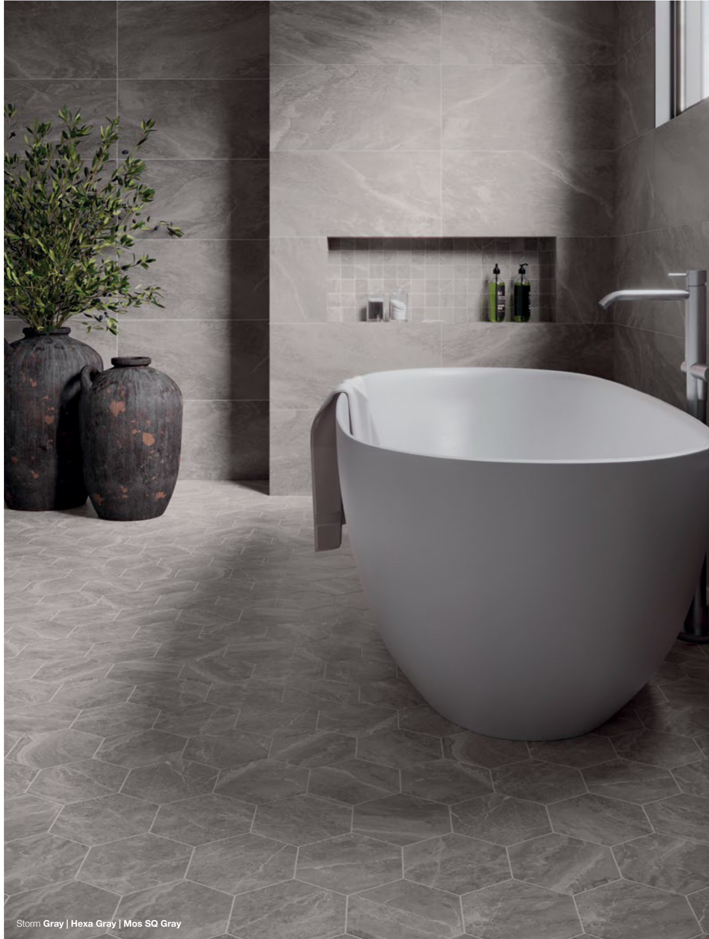
Storm Gray | Hexa Gray | Mos SQ Gray