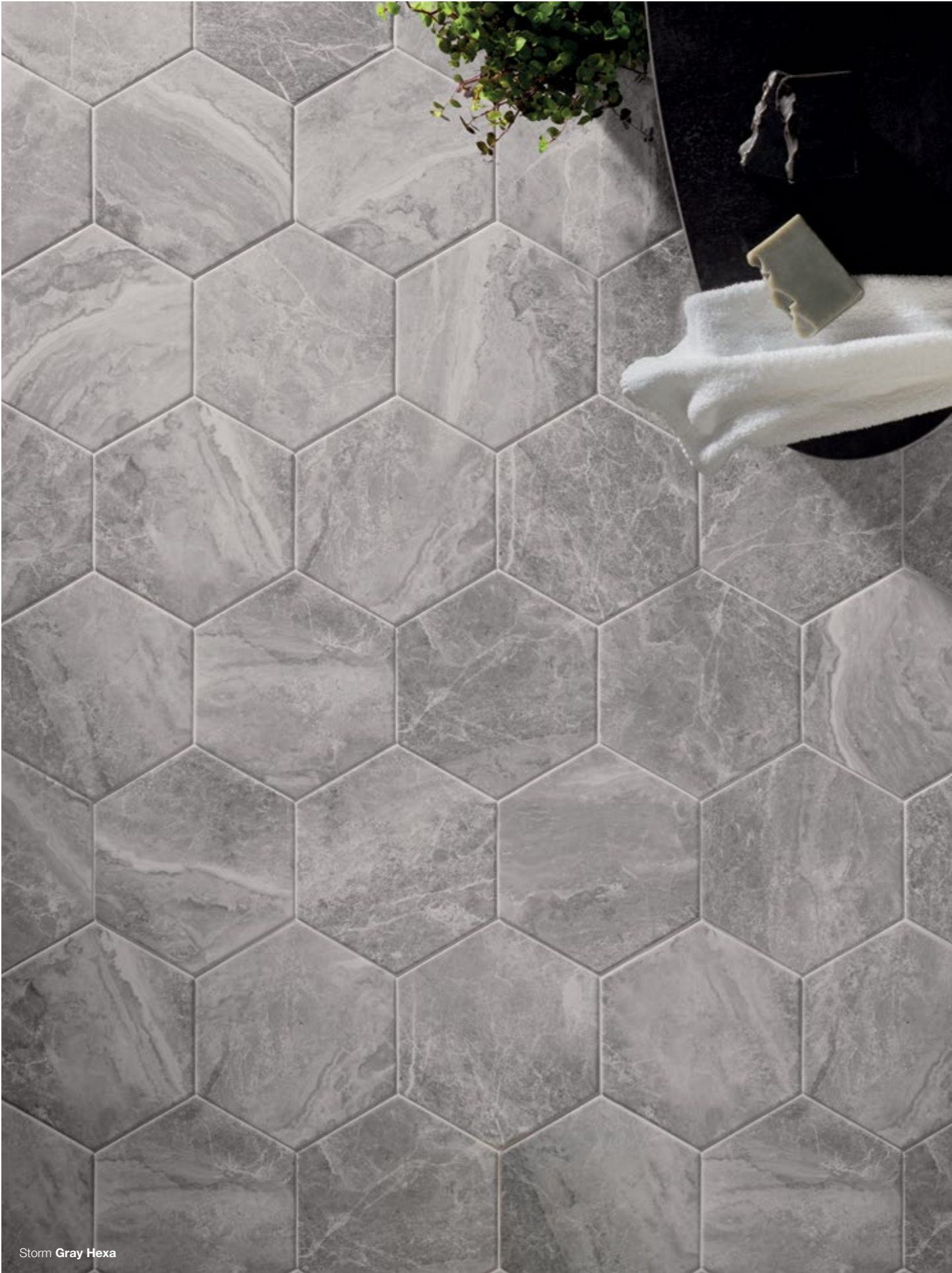
Storm Gray Hexa