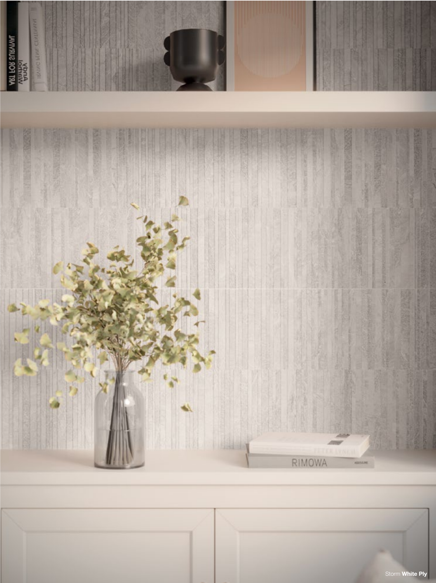
Storm White Ply