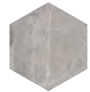
Mos SQ 2x2