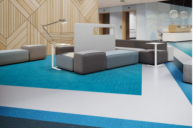
Color Anchor Rubber Tile