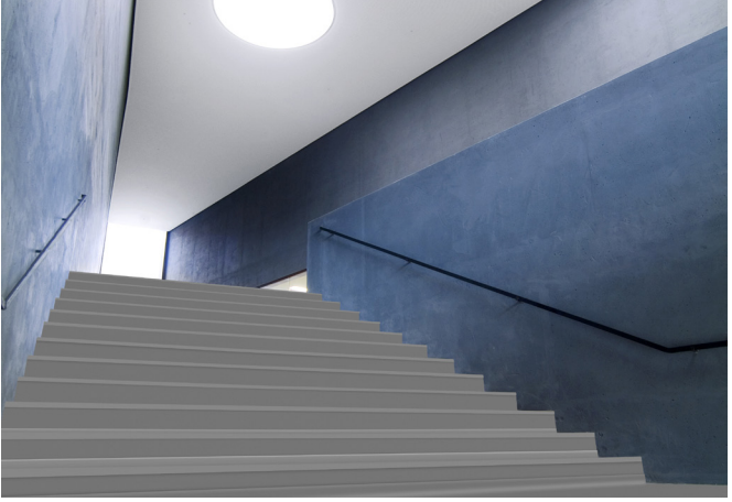
Stair Treads and Nosings