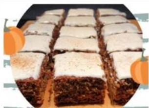
Kitty Horeckvj and mum Cheryl made this Pumpkin spiced cake , using the Halloween pumpkin cake recipe from BBC Good Food.

Here are some of the yummy entries from our October 'can you cook it' challenge. A great use of seasonal vegetables; well done, everyone. We hope that you enjoyed your creative food