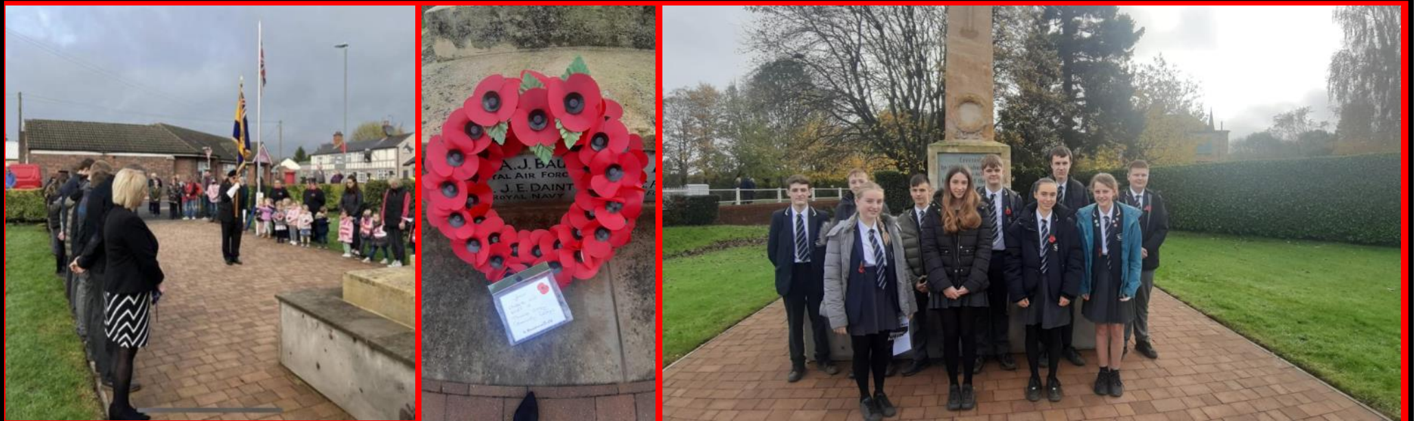
Some of our students and staff represented the college at the Broughton Astley Memorial remembrance event on 11/11 at 11:00am.