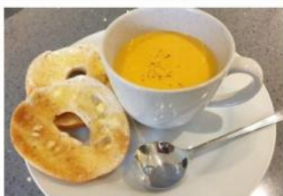
Theo O'Neill made this Butternut squash soup with chilli and crème fraiche .