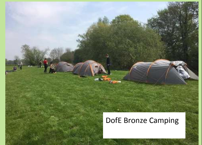
DofE Bronze Camping