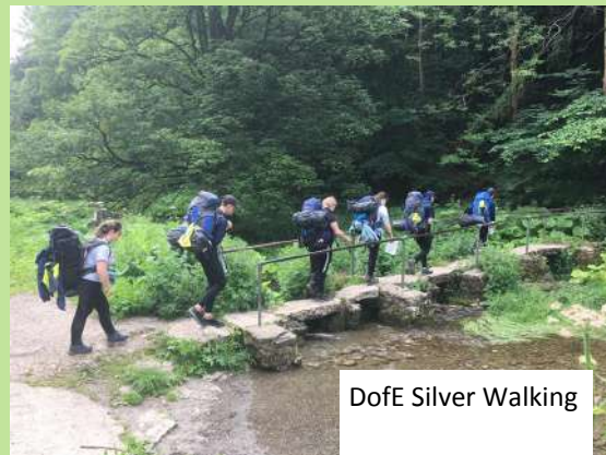
DofE Silver Walking