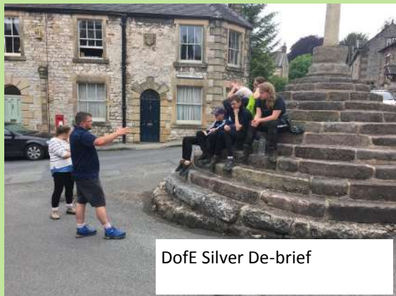
DofE Silver De-brief