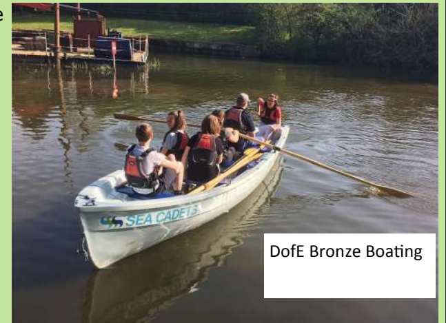
DofE Bronze Boating

Our Silver expedition, which took place in June, required three days and two nights and was based on hillwalking in the Peak District after local practice walks and camps in the Charnwood Forest area. The duration of the other sections increases at silver. Our students have chosen a variety to suit their interests, and all are working towards completion in the next academic year.