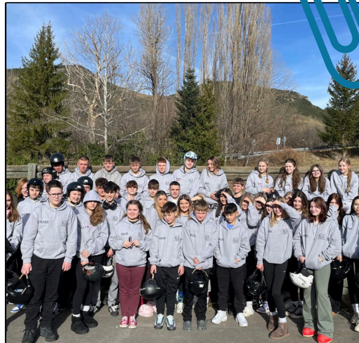
Spain (ski trip)