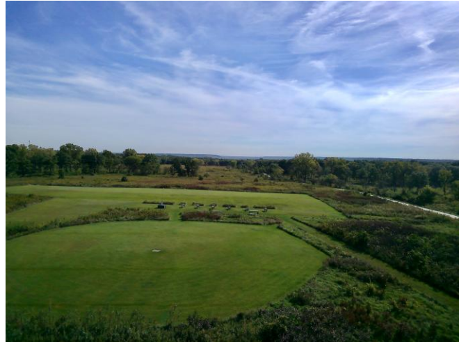
Woodland Aero Modeler's Flying Field at Waterfall Glen Forest Preserve, Lemont, Illinois

We had our Executive Meeting, and we have dates for Clow, our Open House, Points Night, the (see From the Editor next page)