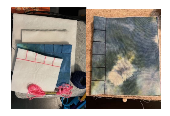
Fabric Book Construction Workshop with Norma Santiago