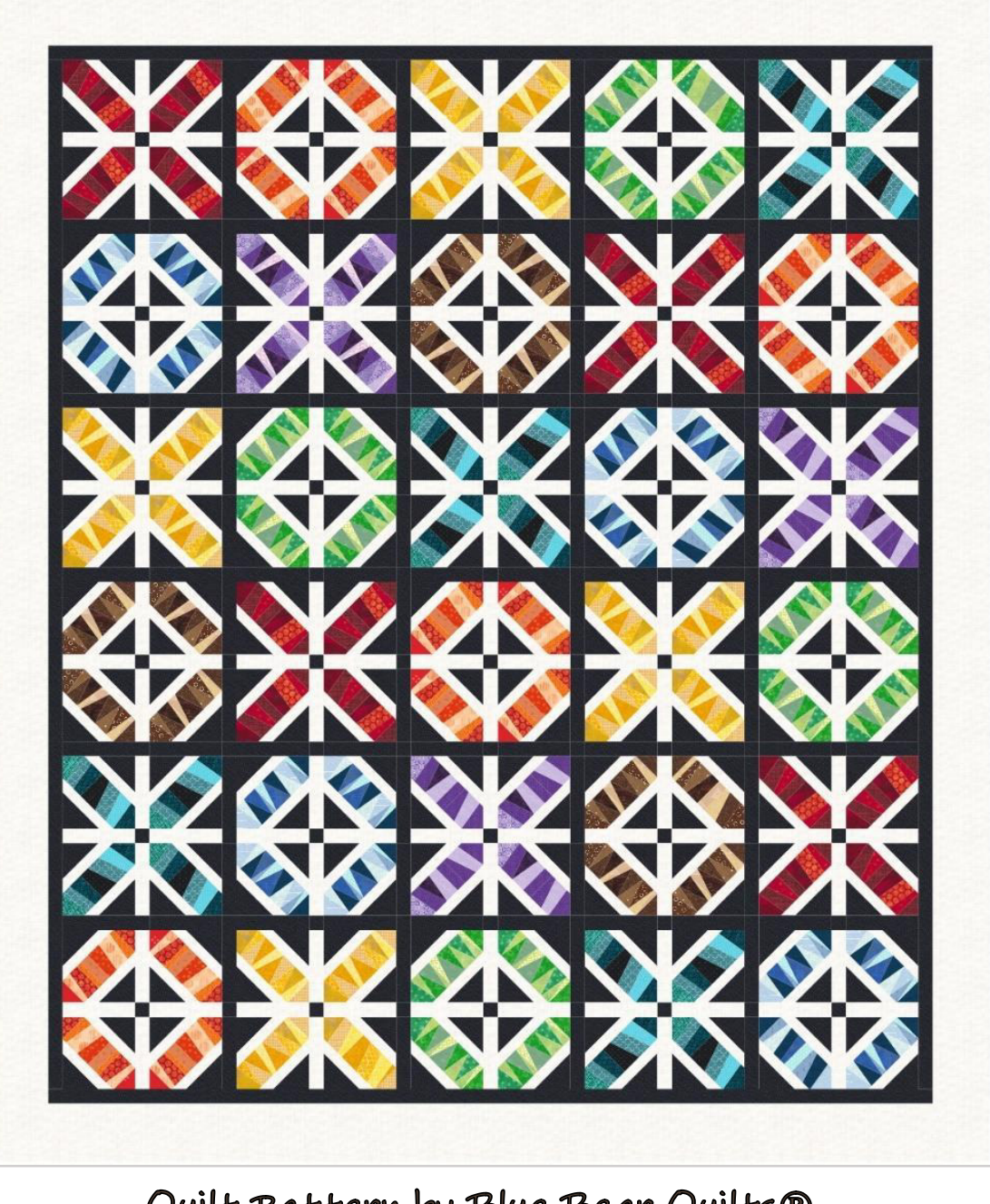
Quilt Pattern by Blue Bear Quilts® BBQ #221 ©Copyright 2024

A Scrap Buster Quilt or Table Runner Finished Quilt 69" x 81" or 69" x 21"