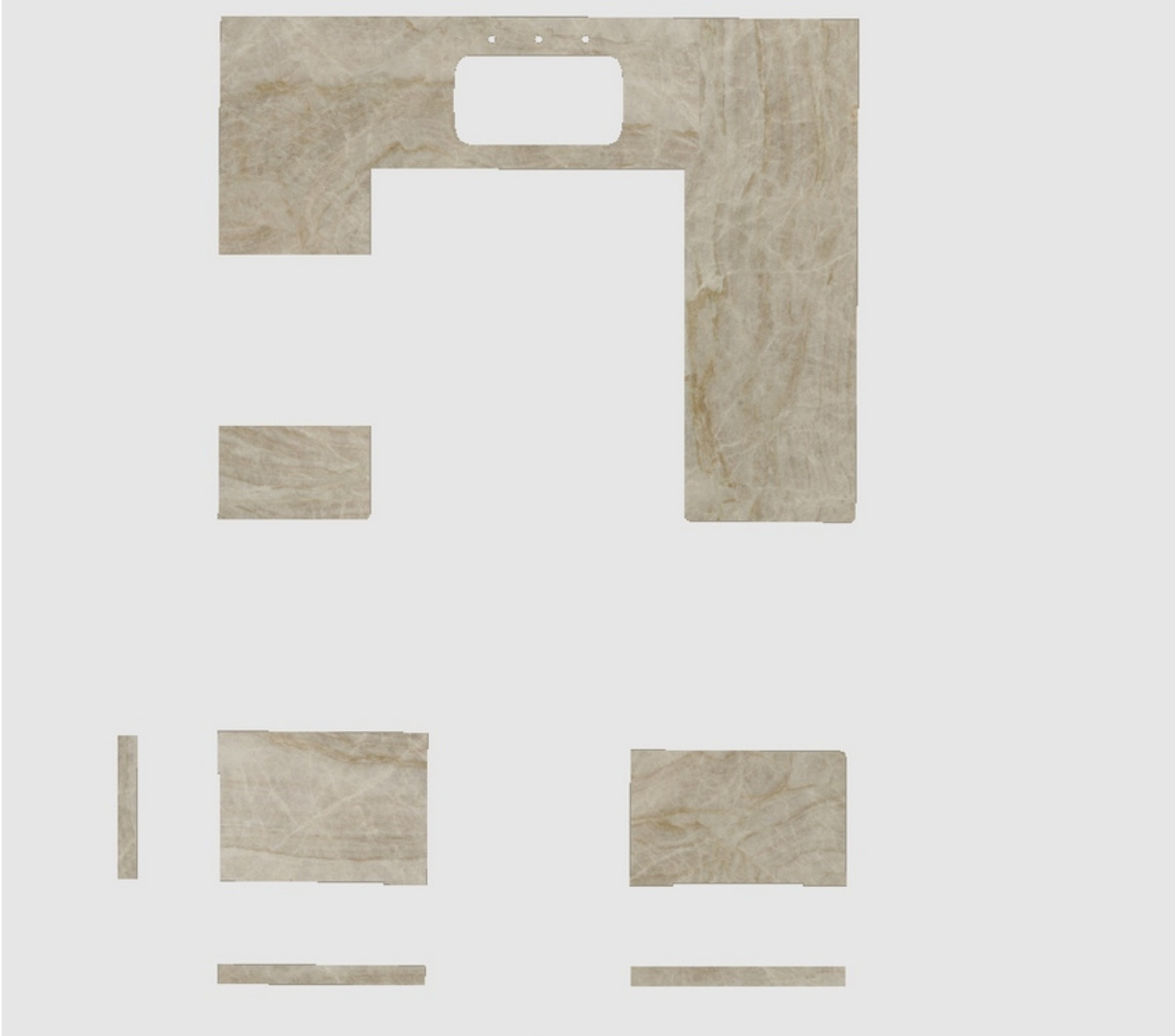
Image 2. Digital Layout