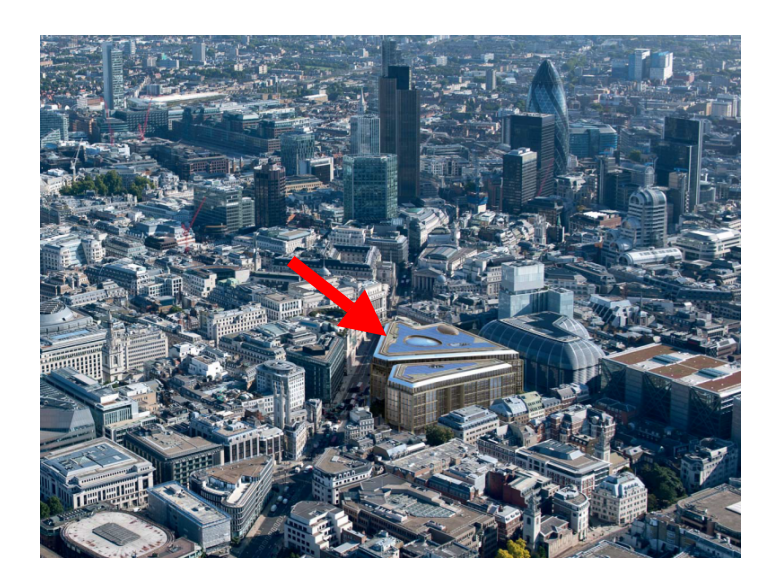
Fig. 1 Location of the Bloomberg London Development

Bloomberg London is a new development in the City of London comprising two high-grade specification buildings (namely the North and South Buildings), with retail units at ground floor level. When completed, it will provide approximately 1,000,000 ft<sup>2</sup> of office and retail space and includes a new entrance to the London Underground at Bank station.