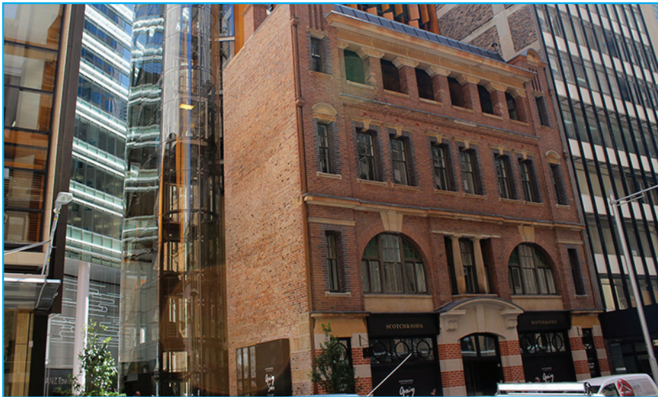
The glass lift and stair contrast the old brick wall nicely, while providing a modern entry