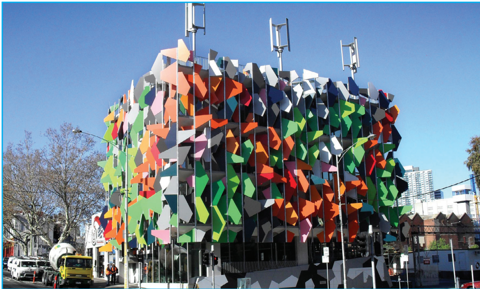
The characteristic colour panels are designed to let daylight in but keep sun heat out

On a former brewery site in Melbourne, this office building has attracted the likes of U.S. Secretary of State Hillary Clinton and Julia Gillard (Australian ex-Prime Minister) on their hunt for green technology which can help build a better, more sustainable future.