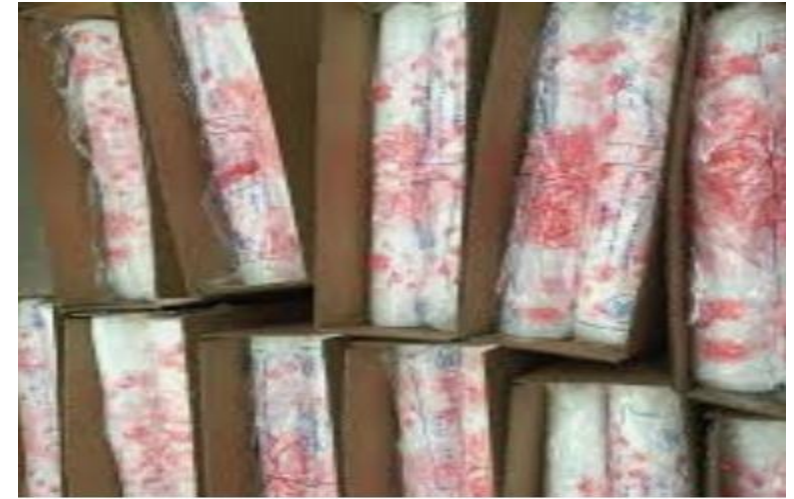
disposable table cover