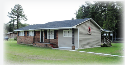
North Carolina State Headquarters 543 Sunset Ave. & Helms Drive, Whiteville, NC 28472 (910) 642- 8309 ncwlahq@embarqmail.com