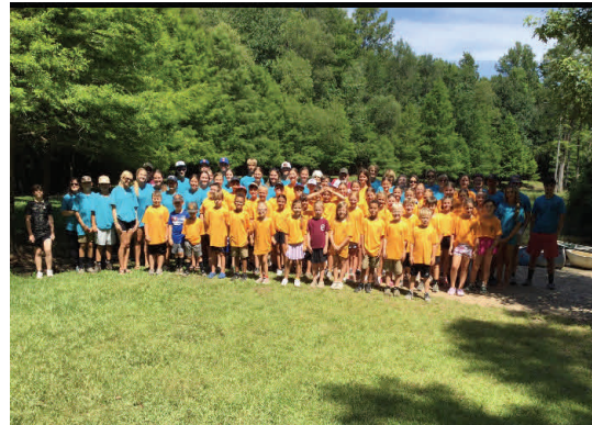
Campers - Pioneer Day Camp 2024

We will offer 200 tickets only for a donation of $100.00 per ticket. This ticket will enter you in the drawing and entitle you to "Dinner for Two" at the banquet (dine-in only; no take-outs) and drawing which will be held on Saturday, August 17th at 6:30pm at the Lake Waccamaw Methodist Church. The First Prize winner will receive $1500.00 cash! In addition, 10 Second Prize tickets will be drawn which will win $100.00 each. You do not have to be present to win these great prizes. ONLY 200 TICKETS WILL BE OFFERED, SO DON'T MISS OUT ON THIS WONDERFUL EVENT!