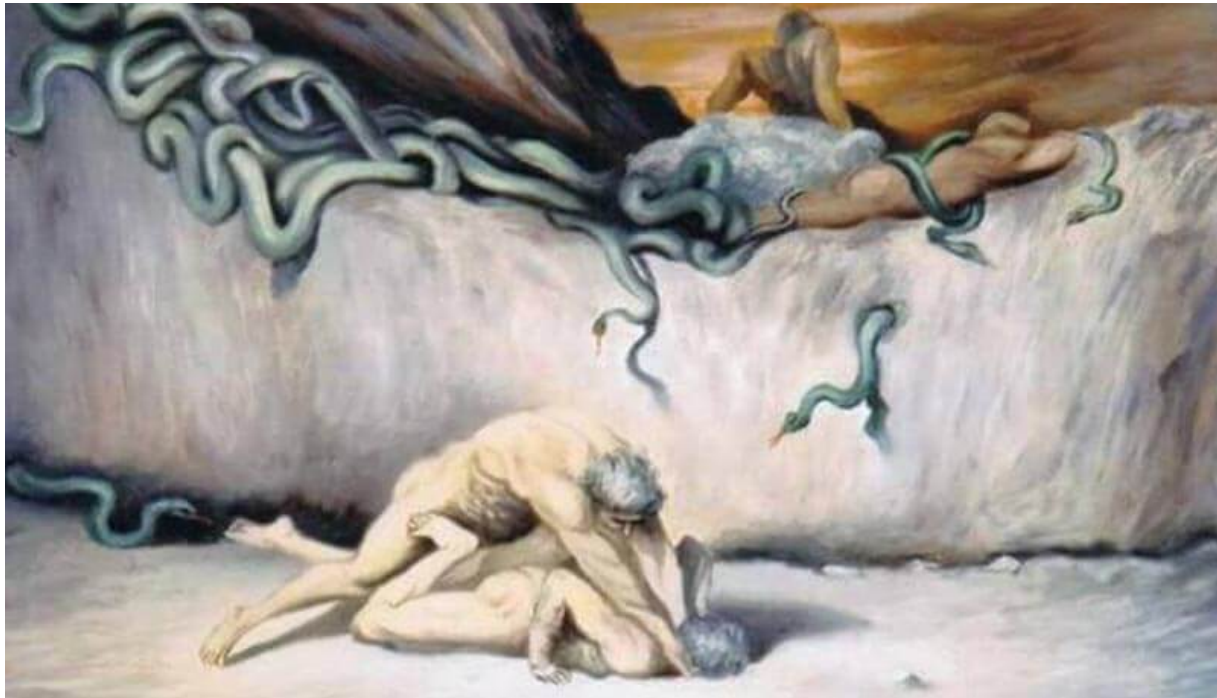
Inferno Canto 30: Impersonators run through hell attacking falsifiers