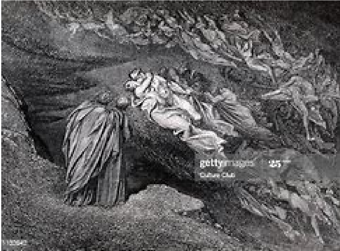
Inferno Canto 5: the lustful are swept up in a whirlwind.