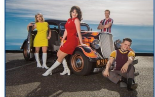
BEACH BOYS: CALIFORNIA DREAMIN'