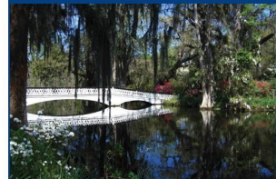
Take in the Picturesque Views of Charleston