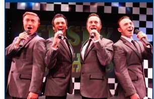
JERSEY NIGHTS SHOW