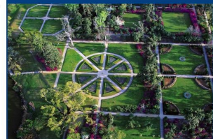
Visit Middleton Place and Gardens