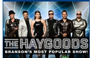
THE HAYGOODS SHOW

Departure: East Toledo Senior Center, 1001 White St, Toledo, OH @ 8 am