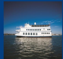
Cruise Around Charleston Harbor