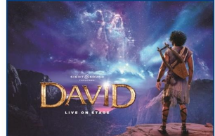
"DAVID" Show at the Sight & Sound® Theatre