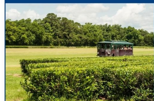
Tour Charleston Tea Gardens

Departure: East Toledo Senior Center, 1001 White St, Toledo, OH @ 8 am