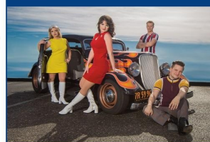
BEACH BOYS: CALIFORNIA DREAMIN'