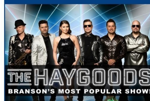
THE HAYGOODS SHOW

Departure: East Toledo Senior Center, 1001 White St, Toledo, OH @ 8 am