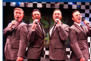
JERSEY NIGHTS SHOW