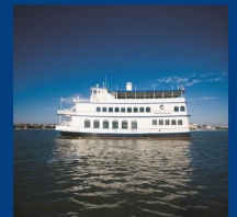
Cruise Around Charleston Harbor