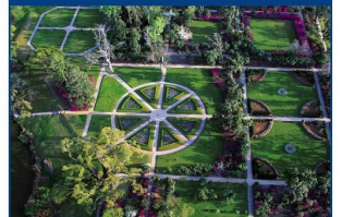
Visit Middleton Place and Gardens