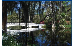
Take in the Picturesque Views of Charleston