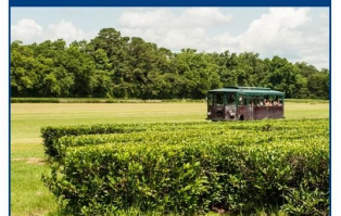
Tour Charleston Tea Gardens

Departure: East Toledo Senior Center, 1001 White St, Toledo, OH @ 8 am