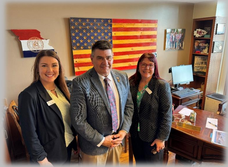
Compass Health Representatives

I have enjoyed the many visits to the office this week; please come by when you are in the Capitol! You are always welcome here. If you would like to tour your State Capitol, please call the office!