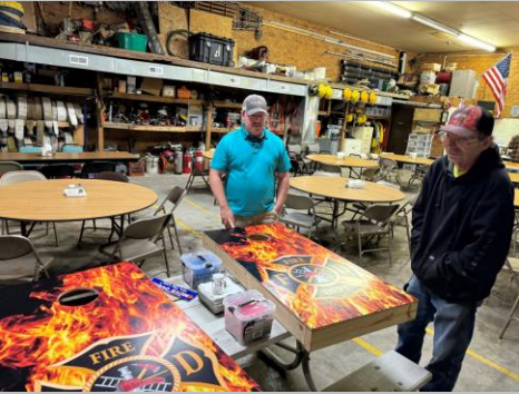
Jadwin Rural Volunteer Fire Department banquet, left

I have had a busy week visiting our area schools, and meeting with rural fire departments in Jadwin and Montauk.