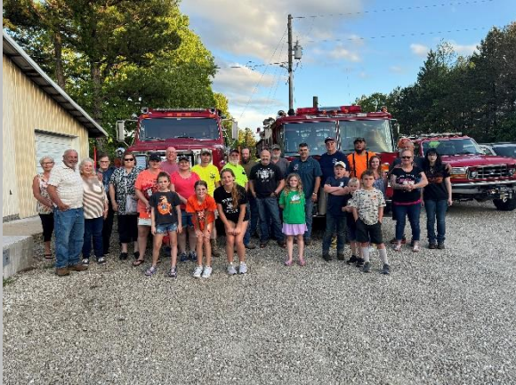
Montauk Fire Department meeting and fundraiser.