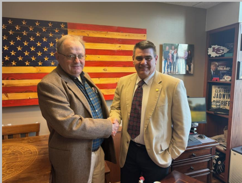
Oregon County Presiding Commissioner visited the office