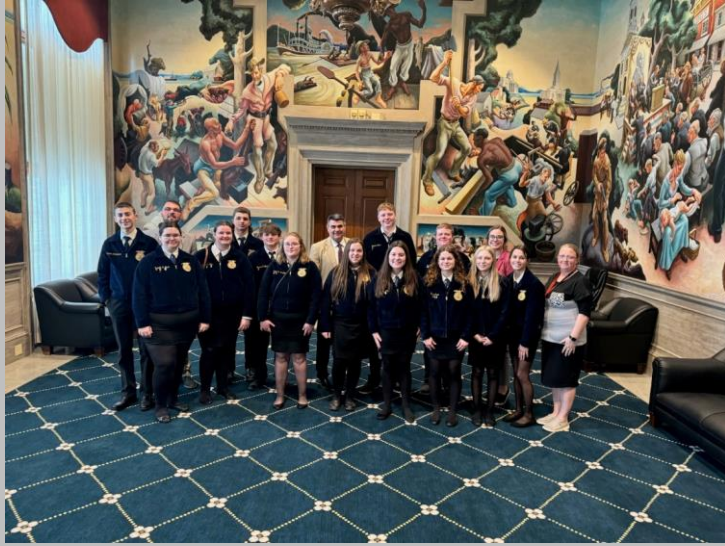
The members of Salem and Steelville FFA are pictured in the House Lounge