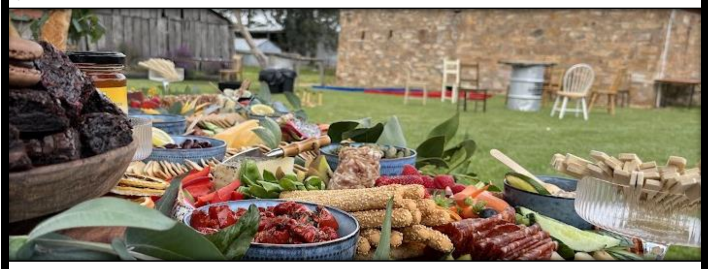
Afternoon treats in the Farmyard

Water - There is no access to water for cooking, cleaning, or drinking; caterers/hirer must provide their own.