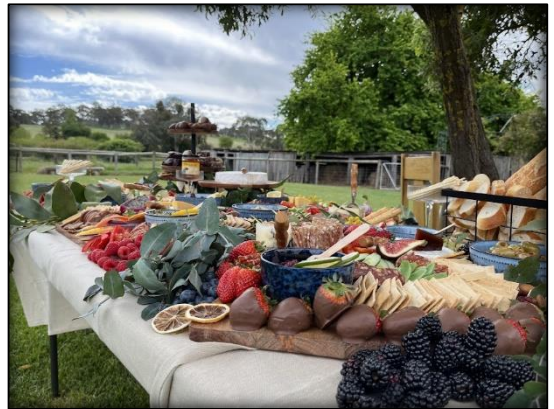
Afternoon treats in the Farmyard

Vendor Recommendations – Remember, we do not restrict you to a particular supplier/s, so whatever and whoever suits you, is okay with us! If you are stuck for ideas, feel free to peruse our vendor/suppliers list located here: www.liebeltfarm.com.au/vendor-recommendations