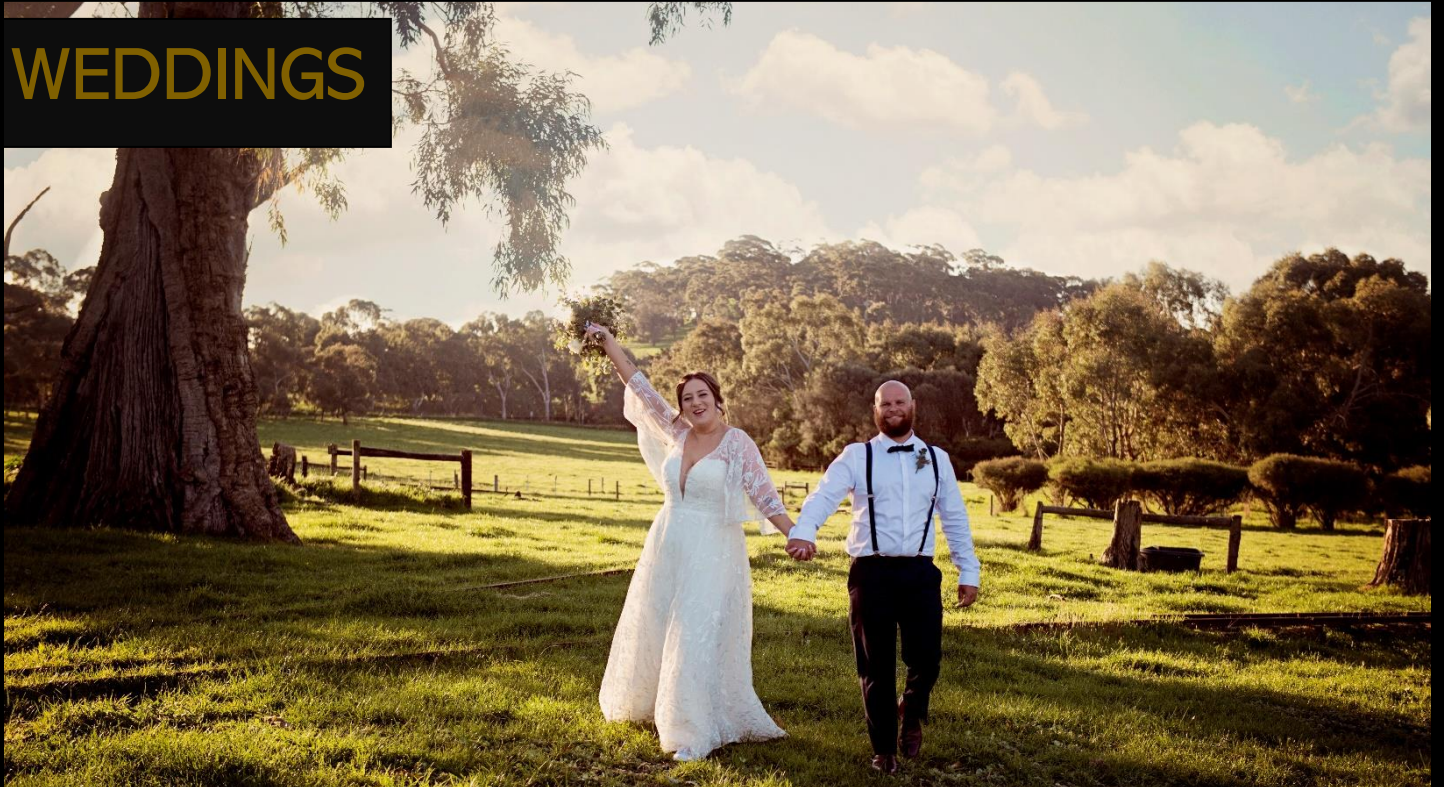
The Liebelt Farm Littlehampton, South Australia