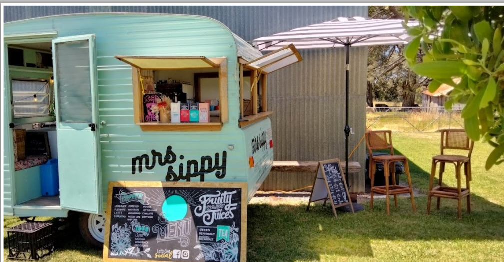
Mrs Sippy's Mobile Coffee and Bar

Vendor Recommendations – Remember, we do not restrict you to a particular supplier/s, so whatever and whoever suits you, is okay with us! If you are stuck for ideas, feel free to peruse our vendor/suppliers list located here .