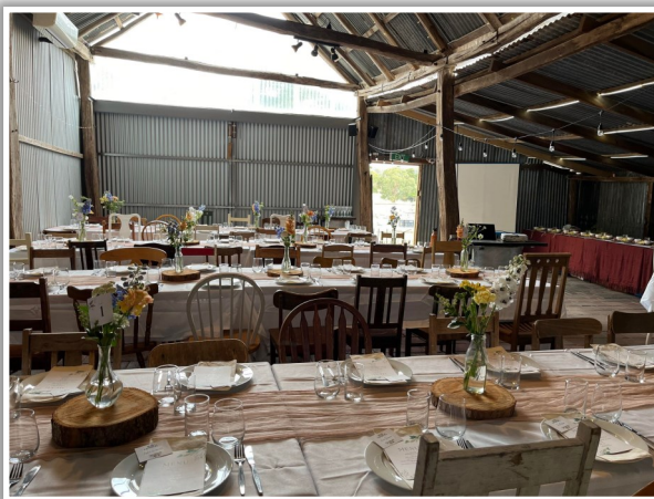
The Chaff House

Water - There is no access to water for cooking, cleaning, or drinking; caterers/hirer must provide their own.