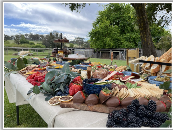
Afternoon treats in the Farmyard