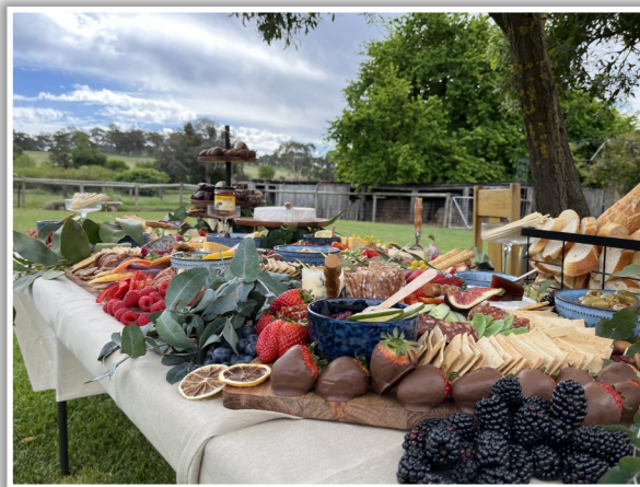
Afternoon treats in the Farmyard