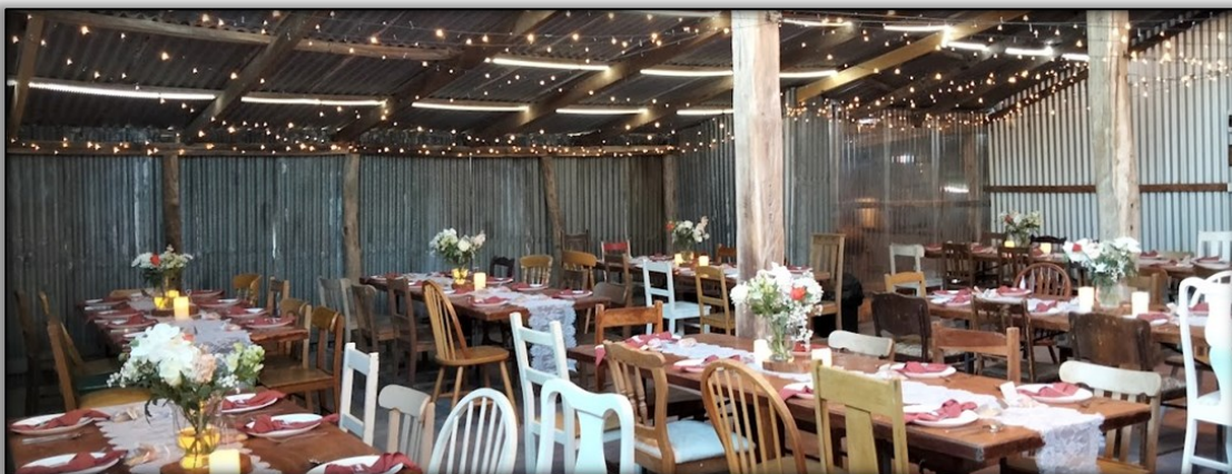
The Chaff House

Lighting – At dusk, outdoor floodlights will come on in all public areas, including the car park, toilets, farmyard area and pathways/driveways. The indoor Chaff House has spotlights and fairy lights on the ceiling. You are most welcome to bring your own fairy/outdoor/festoon lights to put throughout the venue.