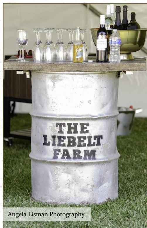
Angela Lisman Photography

Typically used for: Ceremony, Cocktail Hour, Outdoor Reception