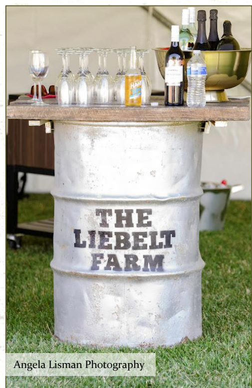
Angela Lisman Photography

Typically used for: Ceremony, Cocktail Hour, Outdoor Reception