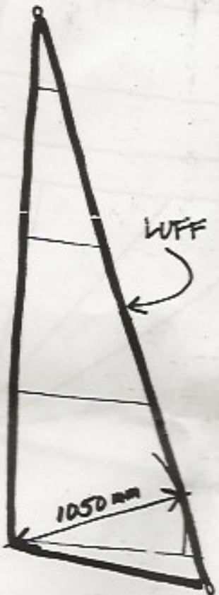
FIG. 12D - JIB