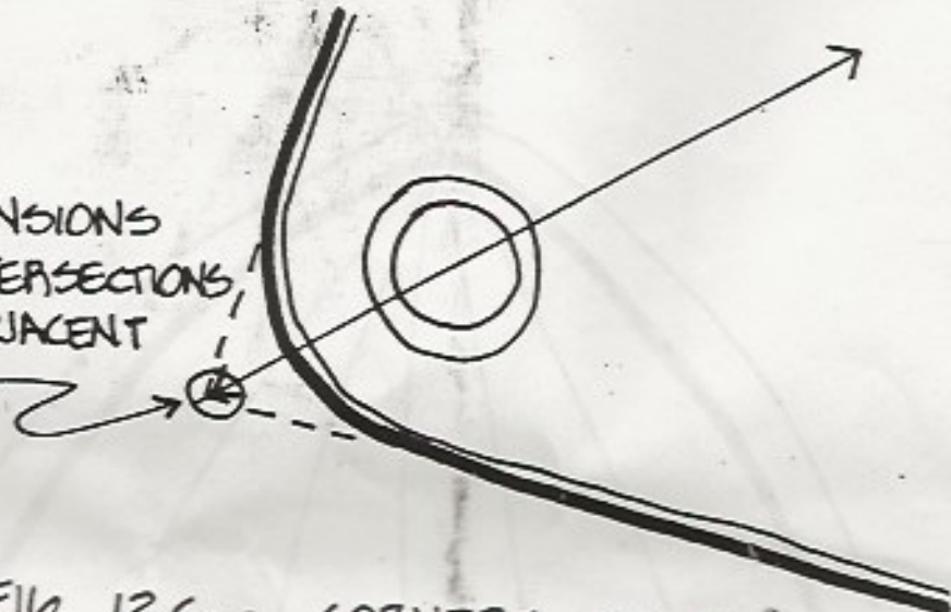
FIG. 12C - CORNERS OF SAILS

SAIL DIMENSIONS ARE TO INTERSECTIONS OF TWO ADJACENT EDGES.