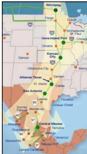
See back for an additional map of the NAFTA Superhighway

According to research done by the Mountain States Legal Foundation, within the past two years the powerful Council on Foreign Relations (CFR) published a report that called for the formation of a North American Union overseen by