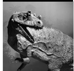
Dinosaurs are on display in the Creation Museum

When you first enter the Creation Museum, you are greeted by a large replica of a dinosaur (they were created on Day 6).