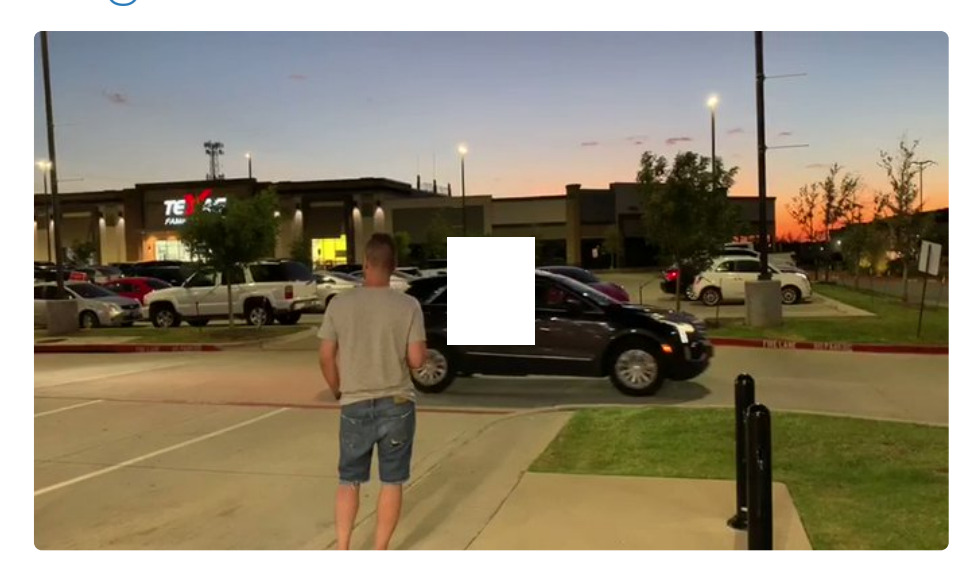
1,868 5:59 PM - Sep 27, 2019 · Frisco, TX

So, @elonmusk - My first test of Smart Summon didn't go so well. @Tesla #Tesla #Model3