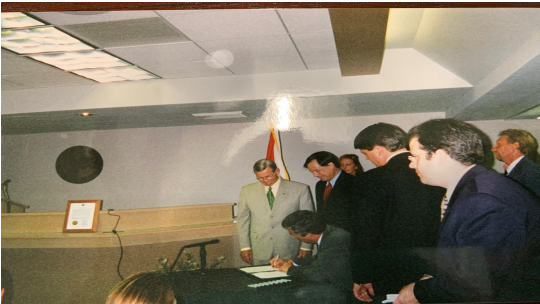
Governor Jeb Bush signs important legislation expanding drug courts in Florida during the statewide drug court graduation.