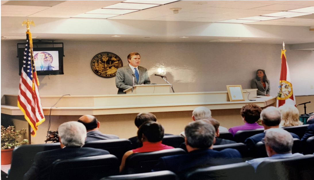
Governor Jeb Bush addresses statewide drug court graduation streamed throughout the state.