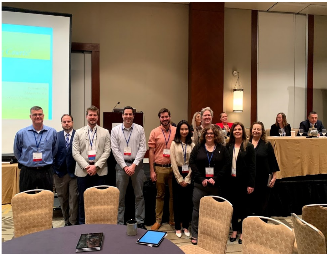
Office of the State Courts Administrator's Staff November 2019 Adult Drug Court Conference