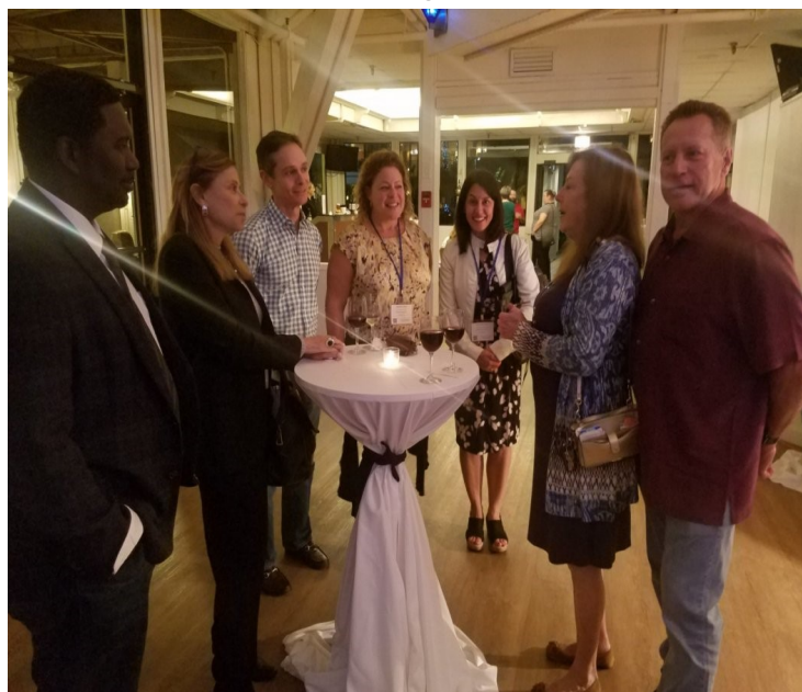
Judge Melanie May and attendees at the 2019 Statewide Drug Court Conference