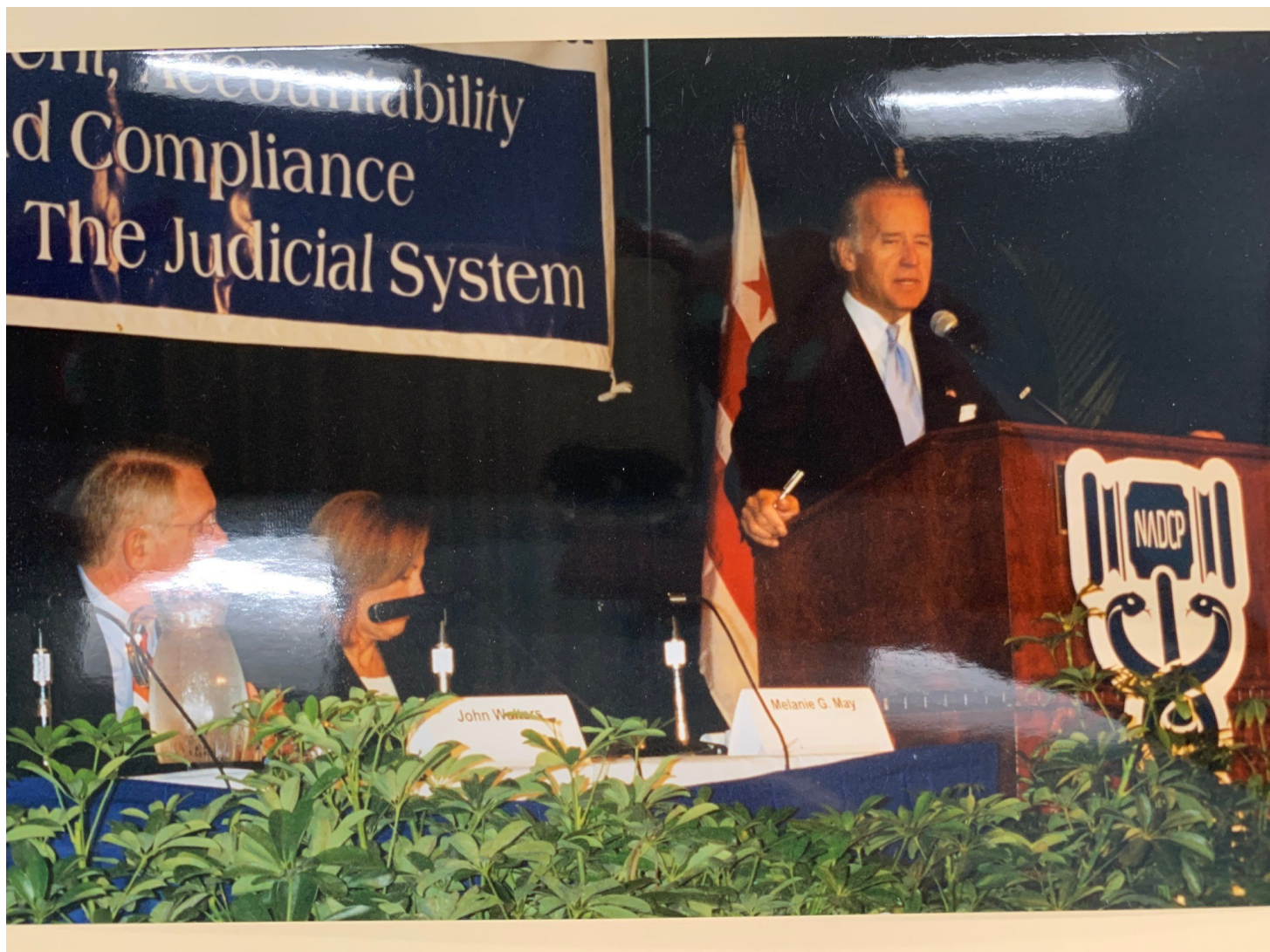
Current U.S. President, then Senator, Joe Biden addressing attendees at the NADCP Conference.