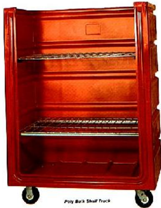
Poly Bulk Shelf Truck