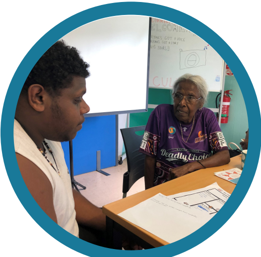
DIGI YARN PARTICIPANT & ELDER

The Deadly Digi Yarns: Cairns West Way project was delivered in partnership with the Queensland Family & Child Commission (QFCC). Young people aged 12-18 worked alongside community Elders in this digital story-telling project, receiving some invaluable cultural mentoring. Over five (5) days, participants developed their story ideas, learned how to create a strong storyline and practiced filming techniques. They then went to various locations in Cairns West to film parts of their story and conduct interviews. Afterwards they spent time producing and editing their short films using video editing software. On the final day, a 'film festival' was held (complete with popcorn for everyone), where the films created by the young people were showcased to family and community members.