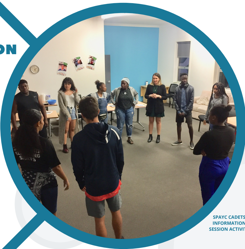
SPAYC CADETS INFORMATION SESSION ACTIVITY

Participants took part in some fun activities to get to know each other and the program mentors. 15 young people aged between 14 and 25 years have made the commitment to be involved in the project. Over the next six (6) months, Cadets will receive one-on-one guidance from mentors, learn leadership skills, earn qualifications and gain working experience.