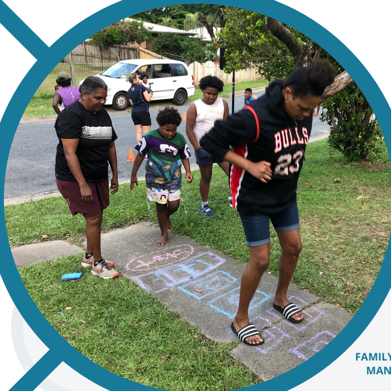
FAMILY FUN IN MANOORA

Encapsulating the concept of community connectedness, the Cairns West Driveway Project is an unstructured activity where the service provider selects a street within the community to visit each Sunday and play some fun driveway games including hopscotch, skipping and ball games. The relaxed and friendly atmosphere of this activity encourages children, families and neighbours to come together to build stronger communities.