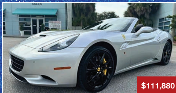
2012 FERRARI CALIFORNIA • 8,956 Mi.