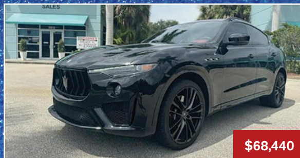
2022 MASERATI LEVANTE MODENA S • 27,727 Mi.