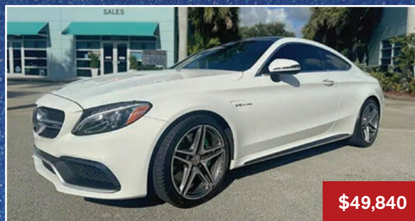
2018 MERCEDES-BENZ AMG C 63 • 15,542 Mi.