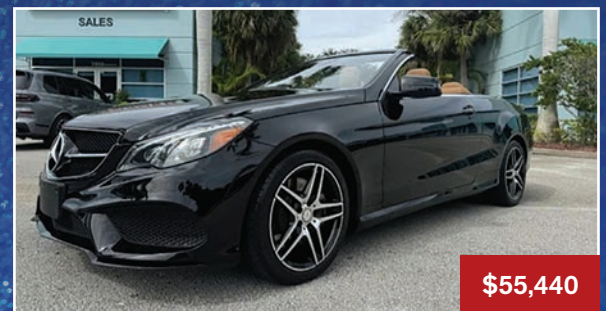
2017 MERCEDES-BENZ E 550 • 10,451 Mi.