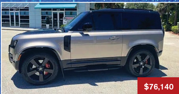
2023 LAND ROVER DEFENDER X • 8,086 Mi.