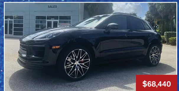
2022 PORSCHE MACAN S • 16,024 Mi.