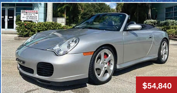
2004 PORSCHE 911 CARRERA 4S • 16,450 Mi.