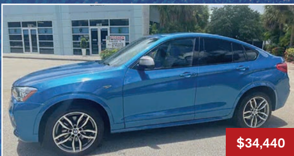
2018 BMW X4 M40i • 29,917 Mi.