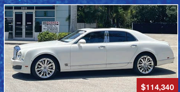
2016 BENTLEY MULSANNE • 8,463 Mi.